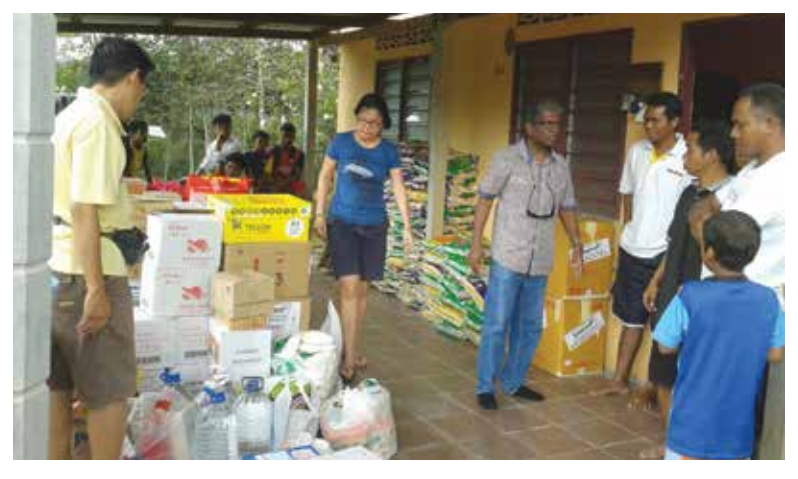
MISSION Orang Asli Flood Relief