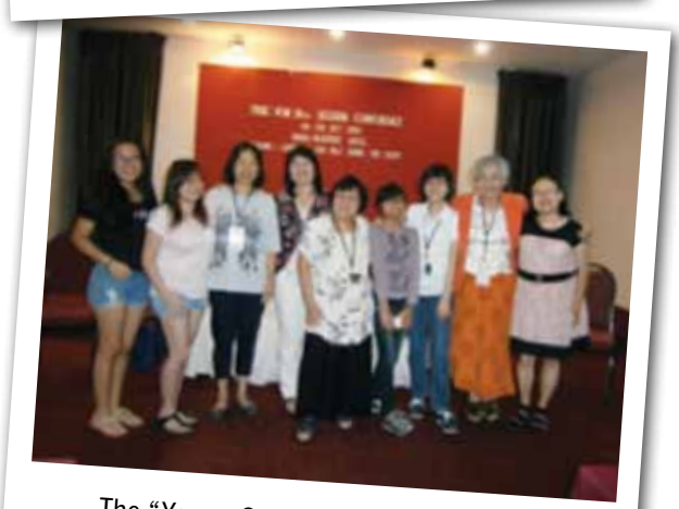
The "Young Ones" shouldn't be afraid!