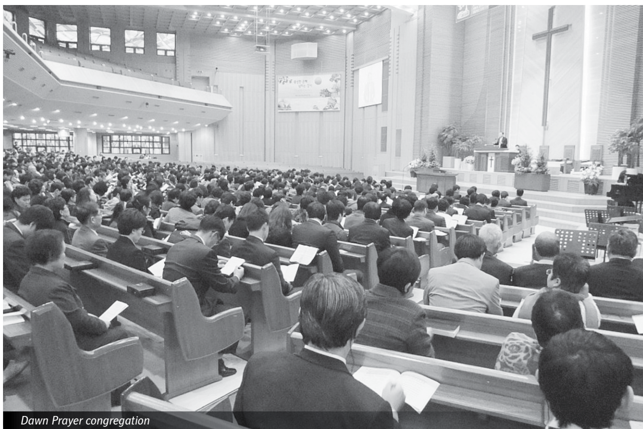
Dawn Prayer congregation

vision of God's will and purposes for their personal and corporate lives at Bupyeong Church. We also pray that the Lord will grant us the strong desire to see the Church in our land becoming stronger and stronger through the intercessions and prayers we learned during our trip. We give thanks to God that our lives will never be the same again because of the people we met, the experiences we went through, and all that we encountered. We also pray that we have the desire to share with others how the Bupyeong Church had impacted us. We experienced the life and ministry and brought home with us peace and blessings to add to the spiritual wealth of our congregation. We pray that all of us have left behind in Korea a positive and lasting impression that will pave the way for other groups to be welcomed and hosted by Bupyeong for a similar experience. We would like to encourage all Pastors and leaders to go for this trip when the opportunity arises. If we wish to see lasting spiritual work built up, it must be birthed and established through prayer and prayer alone. Therefore we are to start dawn prayer in our churches and to pray and pray and pray.