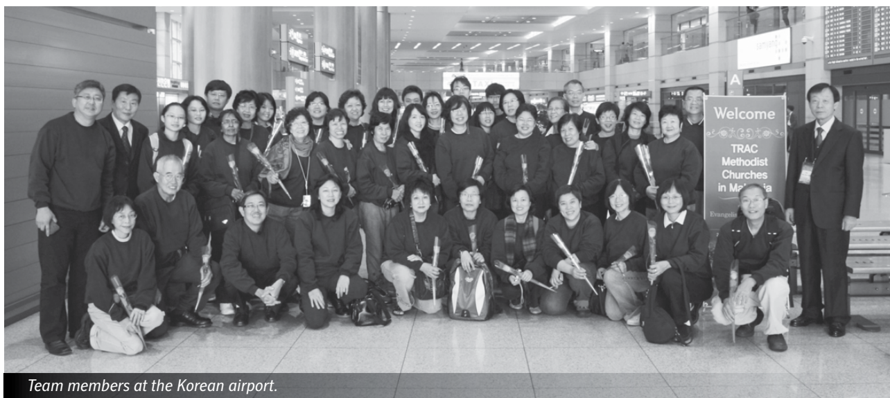
Team members at the Korean airport.