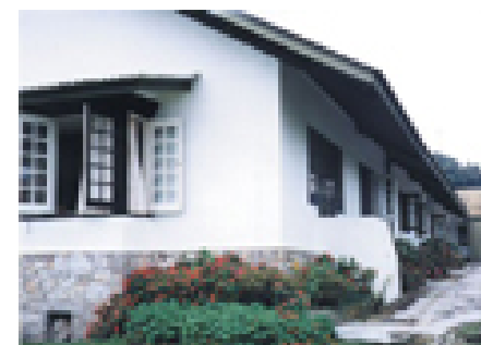
Rumah Methodist, Fraser's Hill (40 beds available)